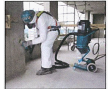
Worker grinding concrete using local exhaust ventilation

The use of respirators to prevent exposure is not acceptable as a primary control when other control measures are available.