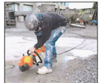
Worker cutting concrete using water for dust control